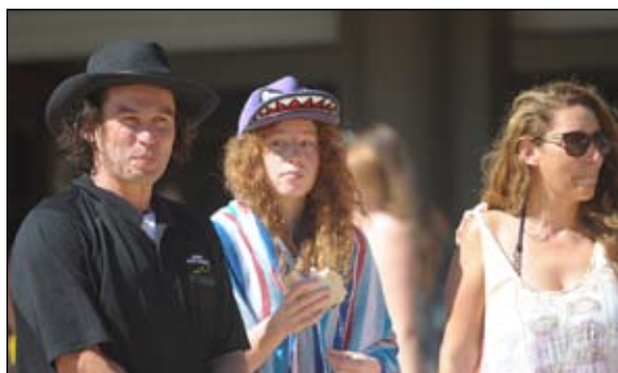
The Moran Family Sponsors of the Moran Rocks to Rocks