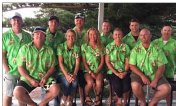
Age Managers in their new team shirts