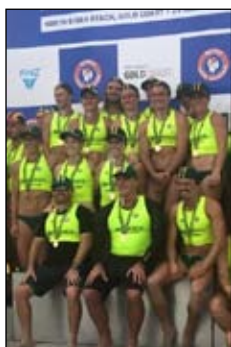
Boat Relay Champions at Australian titles

It was extremely pleasing to see the younger members coming through nippers into the senior club and enjoying their patrols and contributing to our patrol strength. They also performed some incredible rescues along the way.