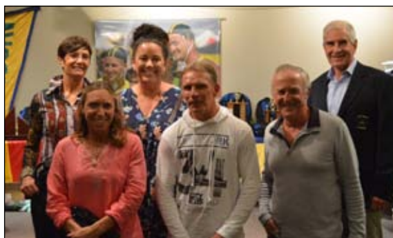
Masters State Medallists