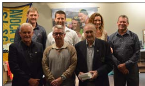
100% Patrol Excellence