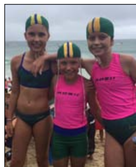
U11 Girls Board Relay Finalists