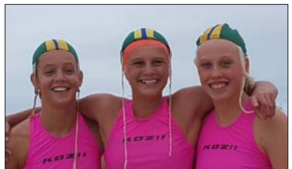
U14 Girls - Gold in Board Relay