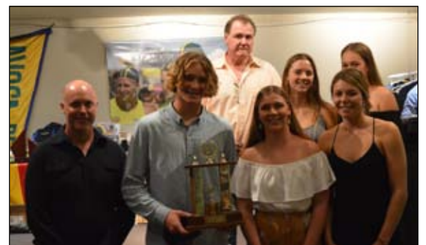
Rescue of the Year recipients