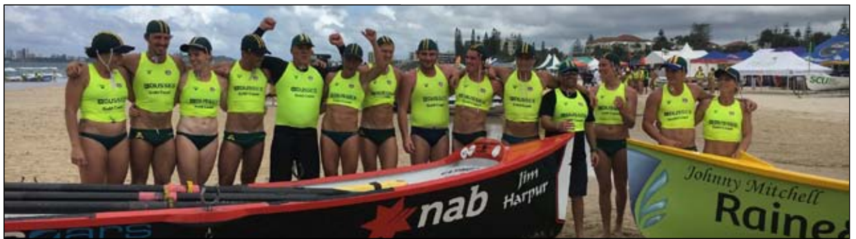
Aussie Gold to our Boat Relay Team Open Men's Z crew, Open Women's crew Zeniths & Under 19's Dog Style

The first major competition for the year started well for the open competitors at the Branch titles held at Umina. The open guys and girls dominated the single and double ski races, including the U19 competitors stepping up to compete in the Open Division with the four top places in the singles, gold and silver in the doubles, and gold and silver in their respective relays. The most encouraging thing for Avoca Surf Club members is to observe all the 17 and 19 year old competitors racing in their age group and then stepping up and challenging the other clubs in higher age groups with great success. All the young ski competitors