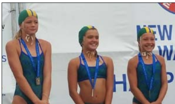
U12 girls - 2nd Board Relay