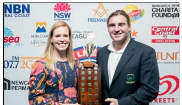
Avoca Beach SLSC Winners of SLS CC Overall Surfs Sports Point Score

Our objectives are to obtain reasonable assurance about whether the financial report as a whole is free from material misstatement, whether due to fraud or error, and to issue an auditor's report that includes our opinion. Reasonable assurance is a high level of assurance, but it is not a guarantee that an audit conducted in accordance with Australian Auditing Standards will always detect a material misstatement when it exists. Misstatements can arise from fraud or error and are considered material if, individually or in aggregate, they could reasonably be expected to influence the economic decisions of users taken on the basis of the financial report.