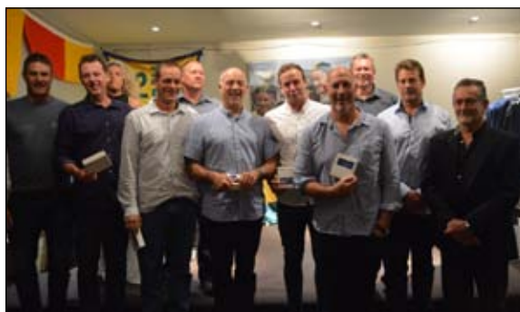
IRB Drivers and Crew