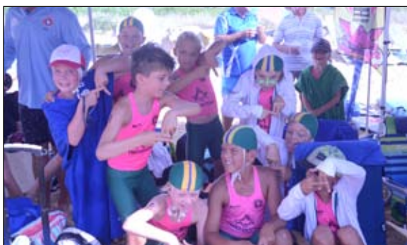
10's Carnival fun