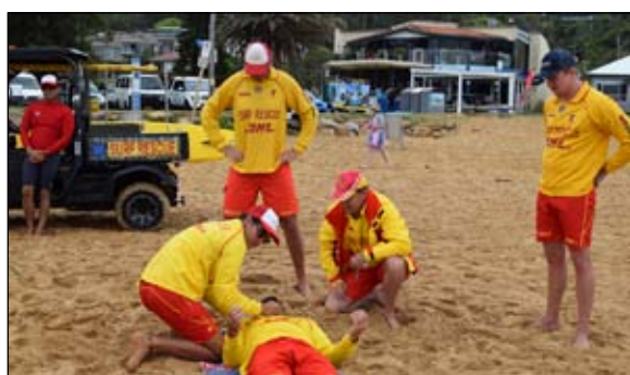
A rescue in action