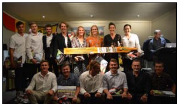
Australian Gold Medallists Boat Relay Team