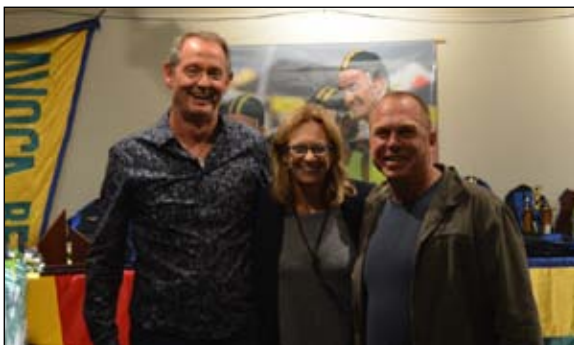
Silver Beach Management recipients

Avoca Beach surf life saving club 2016 - 2017 ANNUAL REPORT