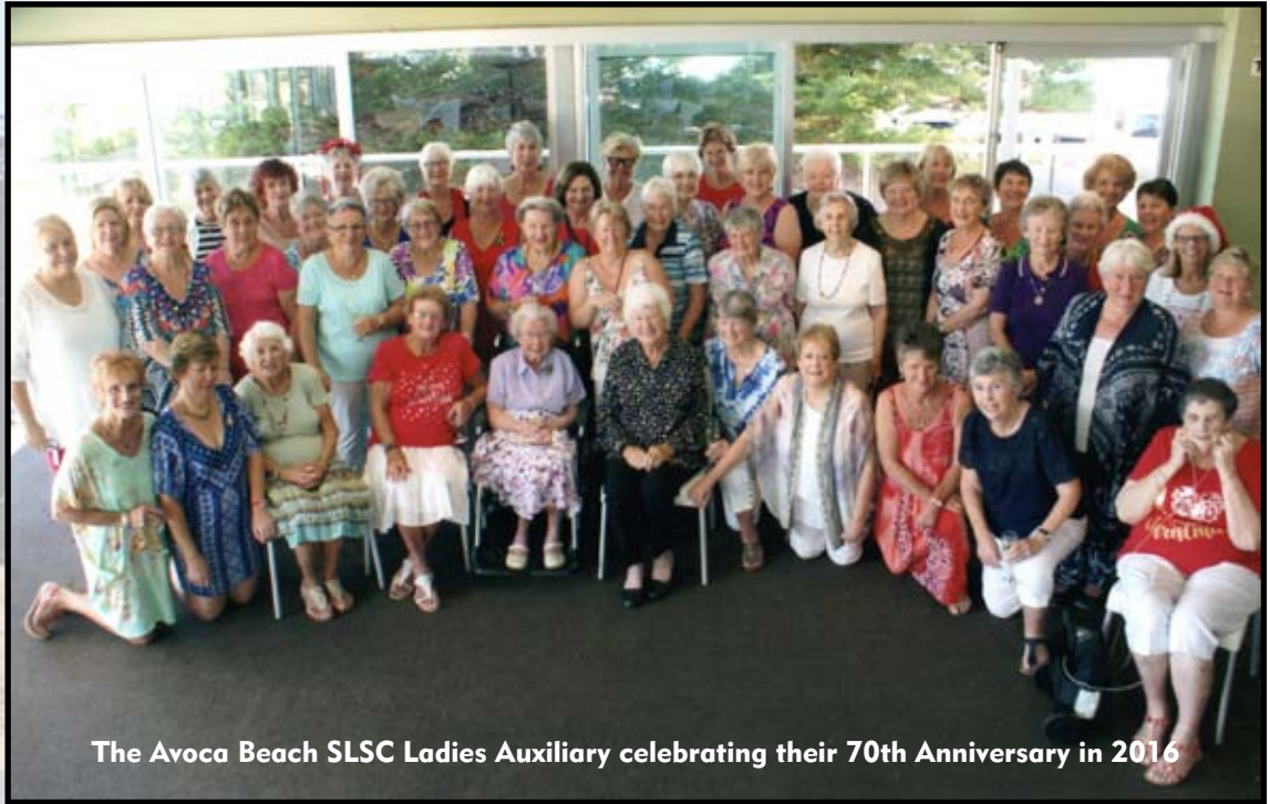
The Avoca Beach SLSC Ladies Auxiliary celebrating their 70th Anniversary in 2016