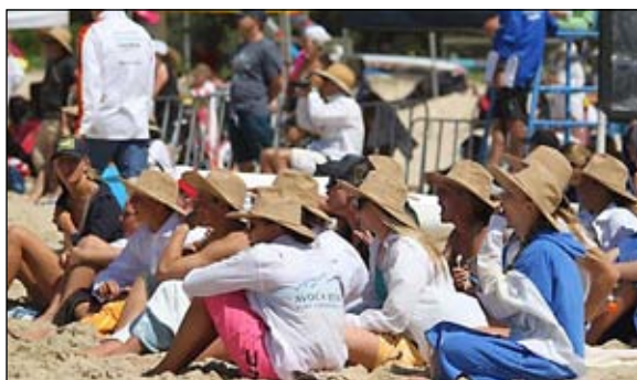
Avoca Cheer Squad, you can leave your hat on!!