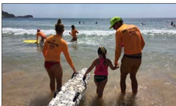
Giving a helping hand