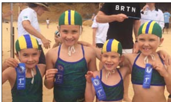
U8 Girls - 1st Sprint