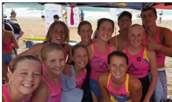
Avoca crew at Interbranch