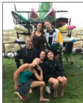
The girls securing equipment before Cyclone Debbie hits