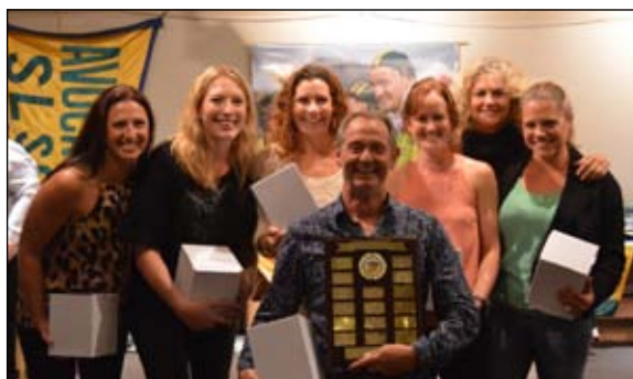
Patrol of the Year - Kernahan patrol