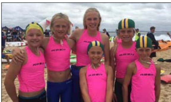
All age board relay