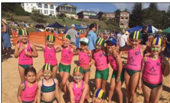
U8 team Avoca