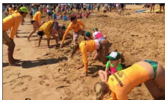
Doing Flags at Sharks nippers