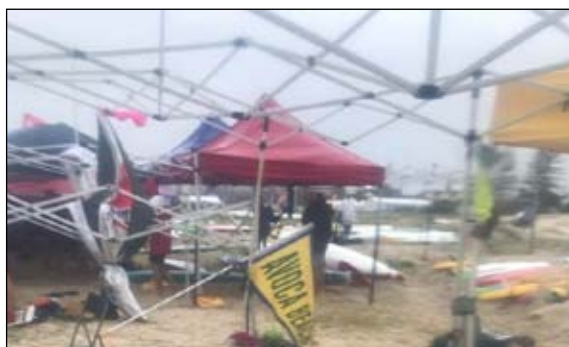
Cyclone Debbie hits Avoca Camp at Aussies