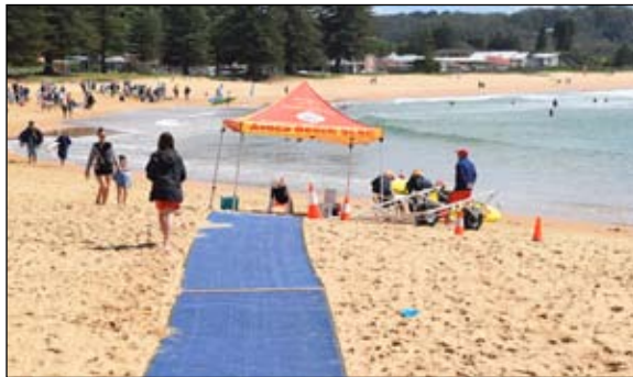
Disability matting access