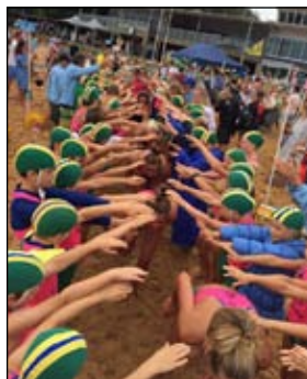
Guard of Honour for U14's last nippers