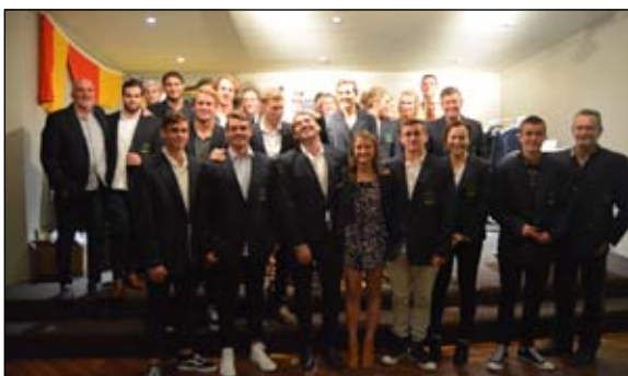
New Honour Blazer recipients with previous recipients