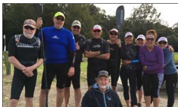
The mighty Manning River paddlers and rowers, July 2016