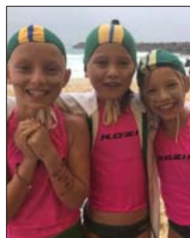
U9 Girls 3rd in Board Relay