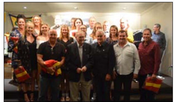
Some of our 35 hours plus recipients