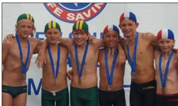
U12 Boys - 2nd Board Relay