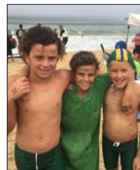
U11 Boys Board Relay Finalists