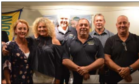
Patrol Long Service recipients