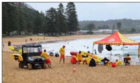
Practicing lifesaving on patrol