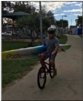
Transport at Aussies

Board & Ironman Coach – Avoca Beach SLSC