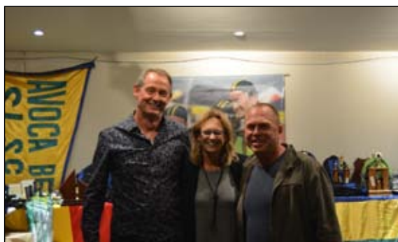
Silver Medallion Beach Management recipients