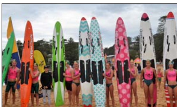
U14 Nippers with their boards