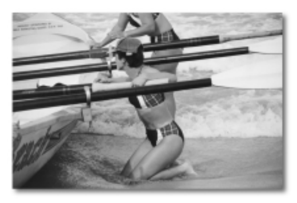
... and now the women have joined him.