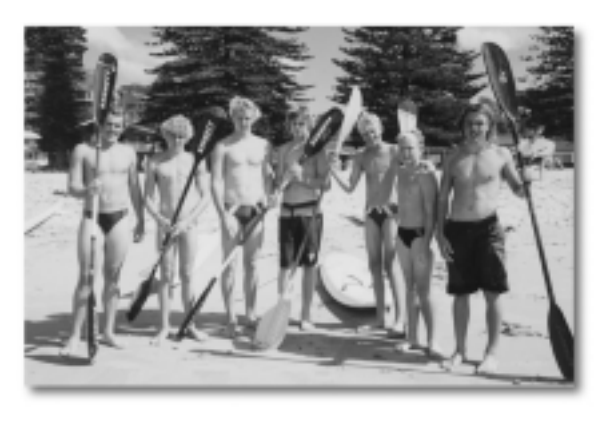
Some of our young champions

The Central Coast Branch championships was the next major event. The last few years saw us beaten by the