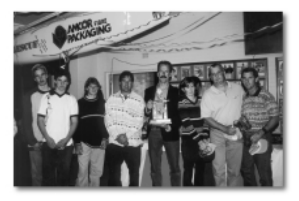
Members of Patrol Number 8 who carried out the Rescue of the Season.

My sincere congratulations to all those involved with this Rescue Of The Season, it was a fine team effort.