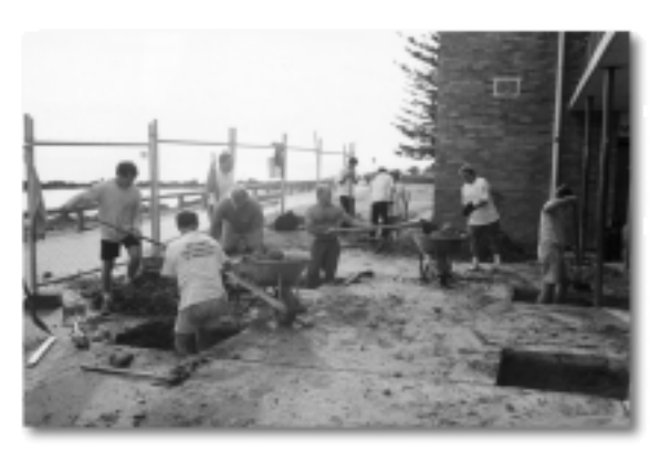
The new deck extension is underway and this is how it began