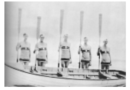
The boat crew looking splendid in their new fawn & black costumes. L to R: C Grey, R Pickett, A Pickett, J Pickett & W Pickett