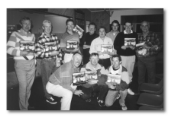
Some of the Distinguished Members receive their awards at the Annual General Meeting

Most of all the attitude of the executive of Avoca Beach Surf Club who worked hard to ensure our management plan was adhered to and when problems arose dealt with them in the interest of the club.