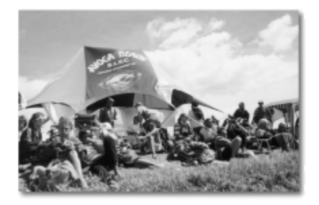
Part of our team at the Mollymook State Titles and our new tent donated by Avoca Beach Bowling Club