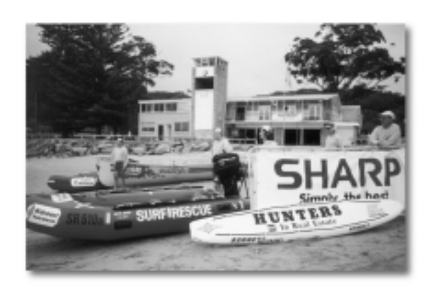
Thank you to our many sponsors

Design and artwork please phone 0417 673383