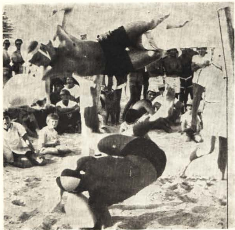
At left: Two competitors from the visiting Redhead and Swansea-Caves Clubs contesting the pillow fight event at the Avoca carnival.