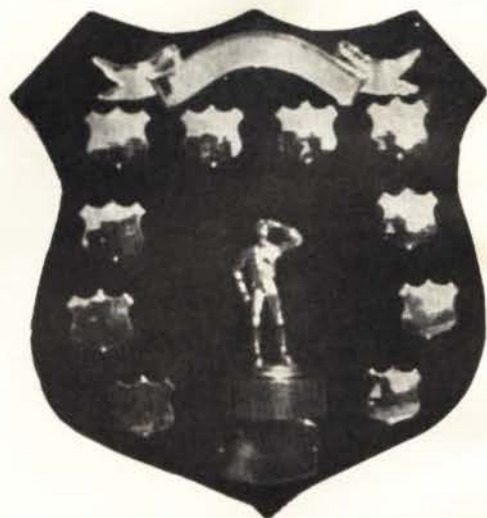
The Syd. Noble Inter-Patrol Competition Shield.