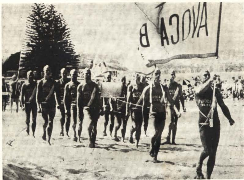
Above: Avoca March Past team leading the parade onto the beach at the club's own surf carnival last season.