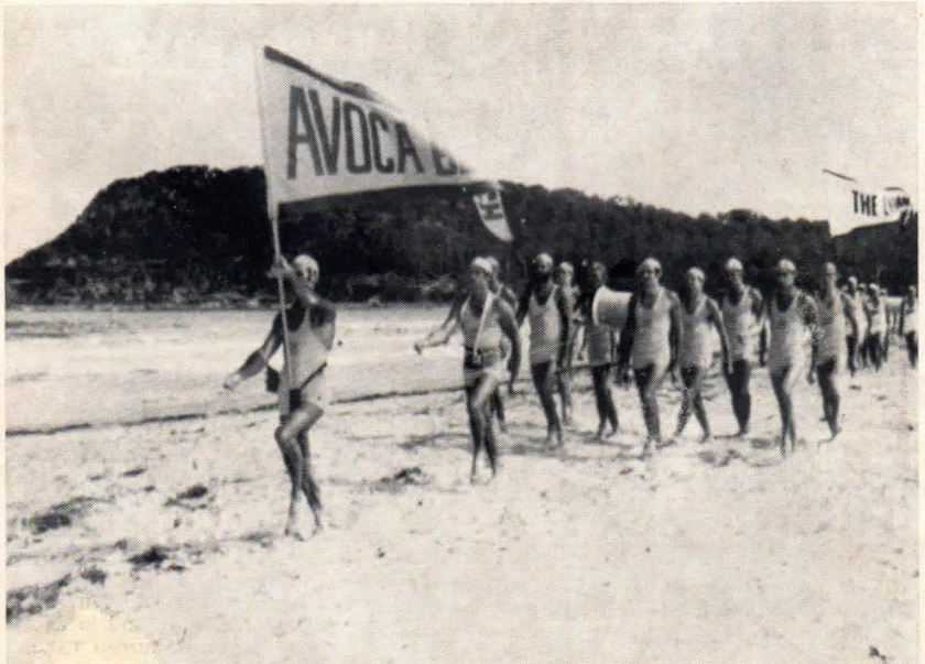
Arch Past team in action at Branch Titles, Umina, last season.